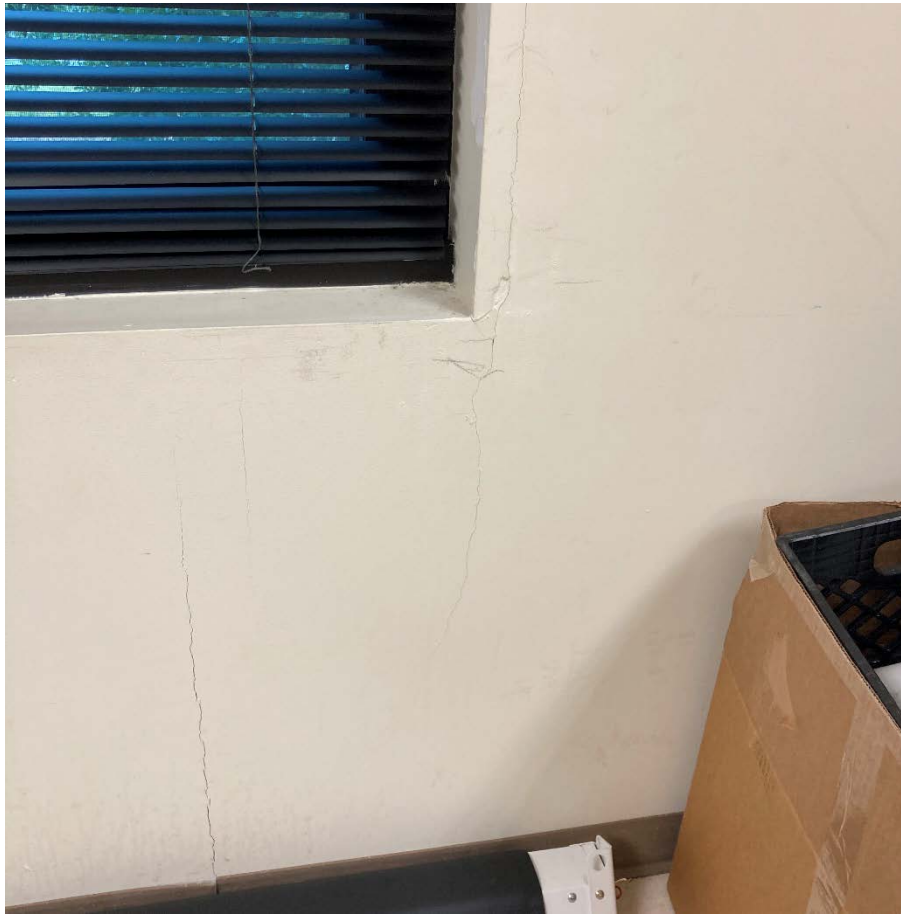
Cracks in sheetrock and frames of windows (typical condition throughout building)