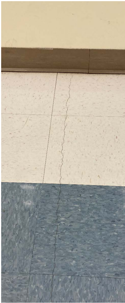
VCT tile cracking (condition typical throughout building)