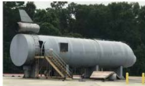
Props at the FSCJ Fire Academy, South Campus