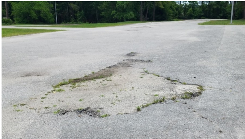
Emergency Vehicle Driver Training Track

The "road course" of the EVOC track is used to train students how to safely maneuver large vehicles through a simulated road course. Students learn how to approach a curve/turn and accurately position vehicle on the road to enable the vehicle to safely track through the curve/turn and have the rear portion of the vehicle not track off of the course (trail over). This is a vital skill for students to learn so they can safely operate through city streets and neighborhoods. This is especially true for operators of articulated ladder fire trucks and semi-trucks. This training cannot be done on public streets unless the streets are closed off to the public.