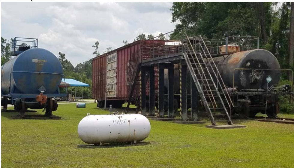
Haz Mat Prop

HazMat training is a specialized course designed to teach fire fighters how to safely mitigate the dangers of an incidents involving hazardous materials. Having the ability to simulate an incident brings real world training to the fire fighters. The Fire Academy has multiple HazMat props. The largest being a “tanker” railroad car. This railroad car is outfitted with valves and hoses to simulate leaking hazardous materials. The railroad car is outfitted with external stairs to allow fire fighters to safely reach the top of the railroad car. A portion of the stair rail and platform has rusted and is not safe for student to use that set of stairs. The handrail needs to be replaced. All of the HazMat props are showing signs of rust, especially the railroad tanker car. The HazMat props should be sand blasted and painted with a rust resistant paint to extend the life of the props. All HazMat props are currently operational, however all air hoses and valves should be inspected and possibly replaced. It is unknown if or when this has been completed in the past.