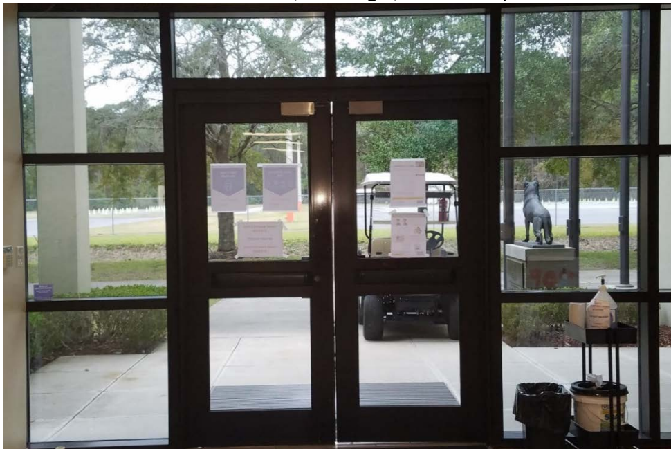
Gaps in doors caused by destabilization of the building slab.