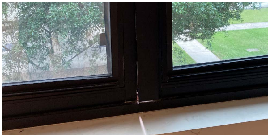
Window frame separation