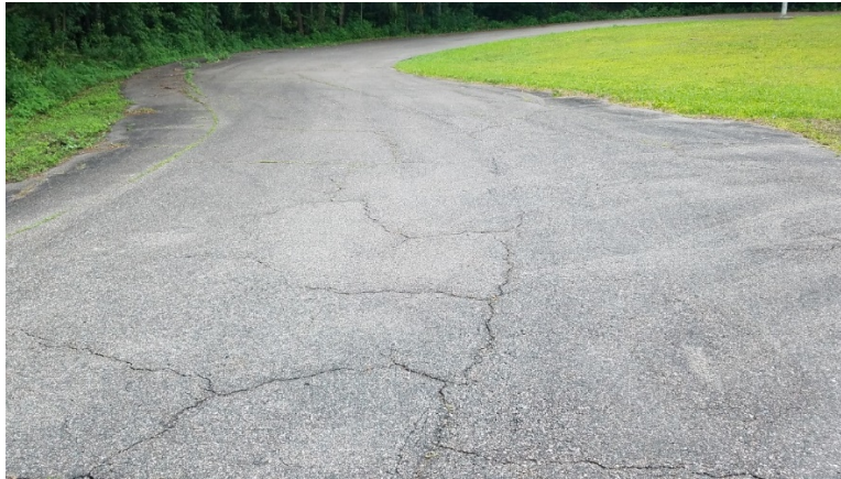
Emergency Vehicle Driver Training Track (condition typical throughout track)