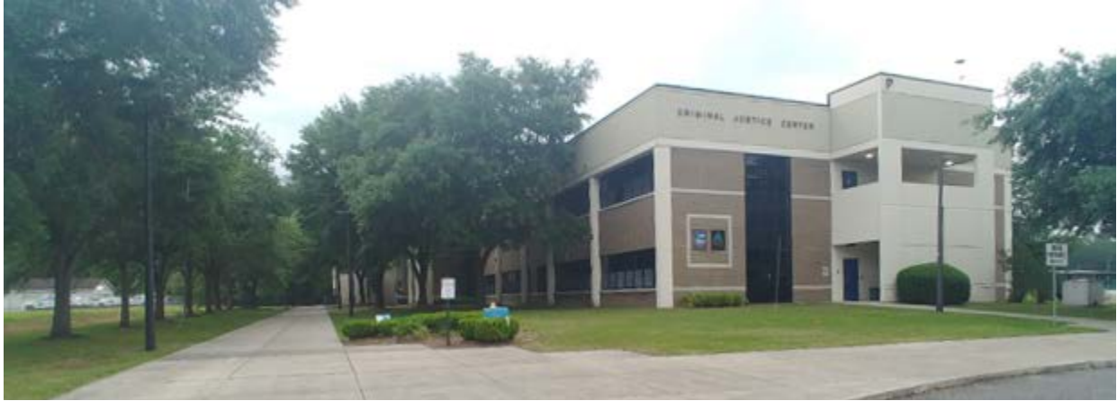
Criminal Justice Center, Building P, North Campus

certified driving track to be a sanctioned police training facility. The asphalt should be milled, and new asphalt applied.