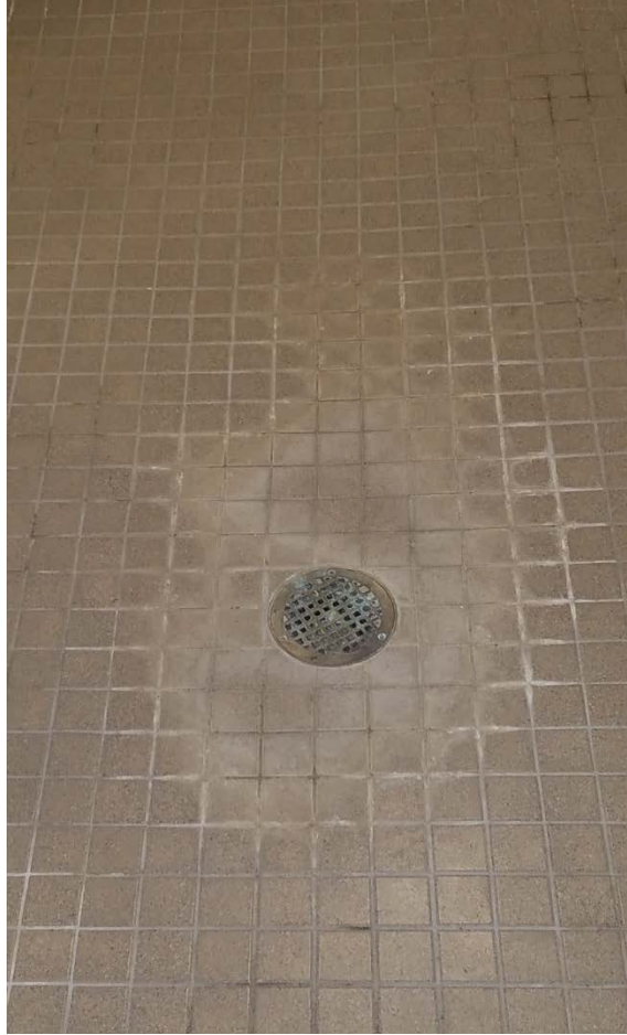
Shower drain repair caused by destabilization of slab