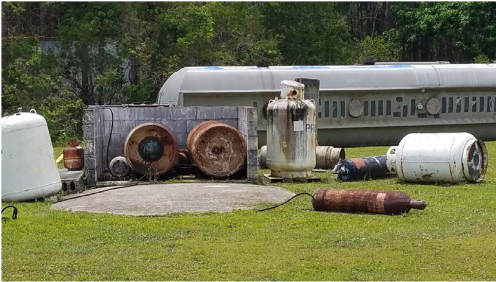
Haz Mat Prop