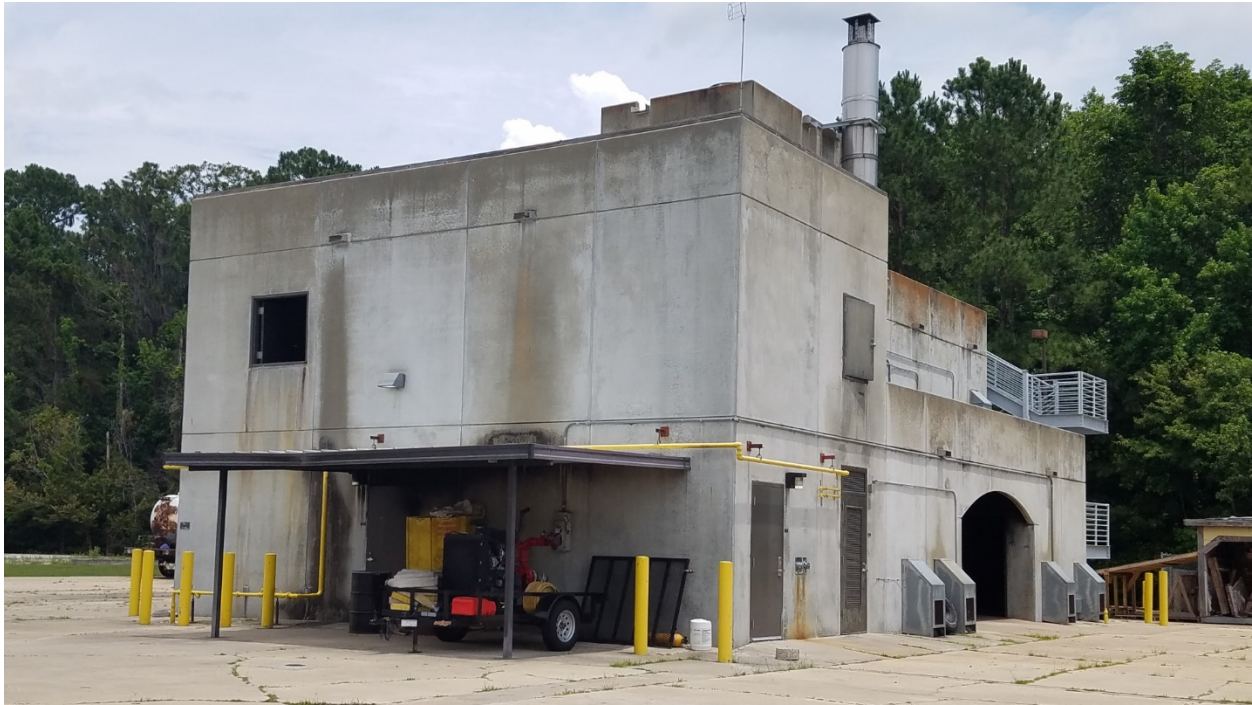
Burn Building, Building-W4